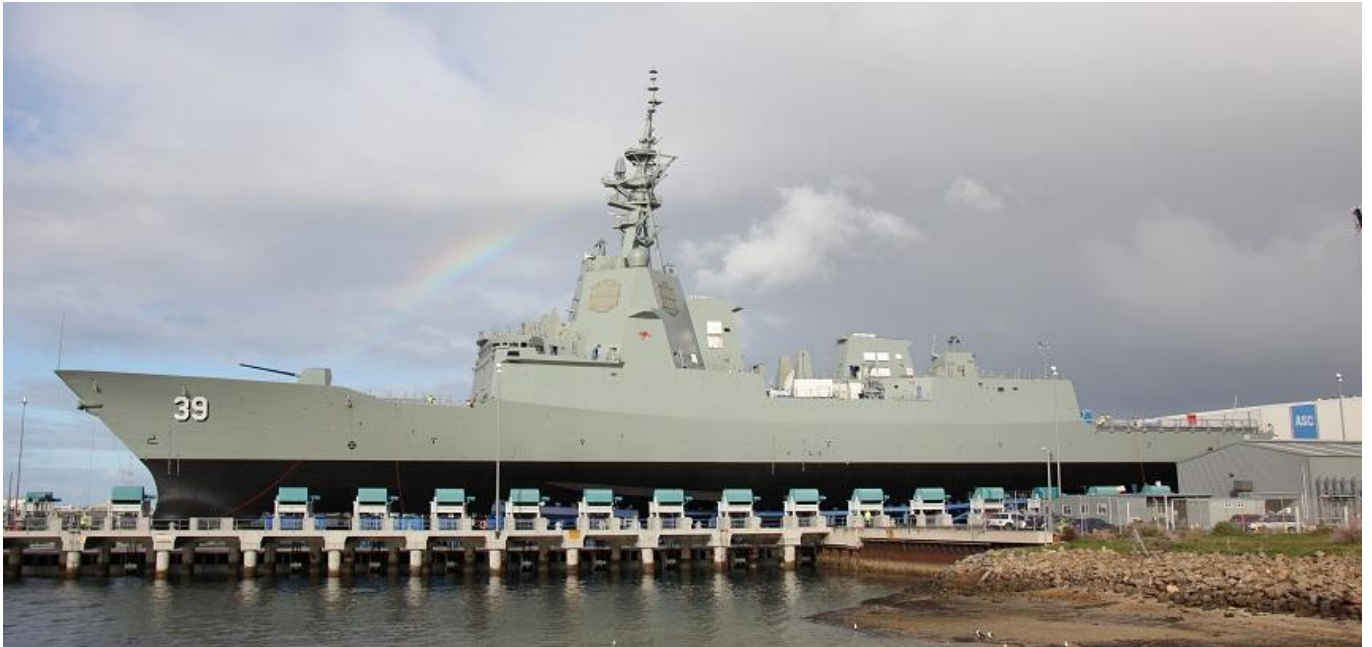
HMAS Hobart 23rd May 2015, on the sea lift.

22nd June 2015: The State Department has made a determination approving a possible Foreign Military Sale to Australia for AGM-88B High Speed Anti-Radiation Missiles and associated equipment, parts and logistical support for an estimated cost of $69 million. The Government of Australia has requested possible sale of up to fourteen (14) AGM-88B High Speed Anti-Radiation Missiles ( HARM ) Tactical Missiles, sixteen (16) AGM-88E Advanced Anti-Radiation Guided Missiles ( AARGM ) Tactical Missiles, four (4) CATM-88B Captive Air Training Missiles, eight (8) CATM-88E Advanced Anti-Radiation Guided Missiles (AARGM) Captive Air Training Missiles, six (6) AARGM Guidance Sections, five (5) AARGM Control Sections, and two (2) AARGM Tactical Telemetry Missiles (for live fire testing), containers, spares and repair parts, support equipment, publications and technical documentation, personnel training and training equipment, U.S. Government and contractor engineering, technical, and logistics support services, and other elements of logistics and program support.