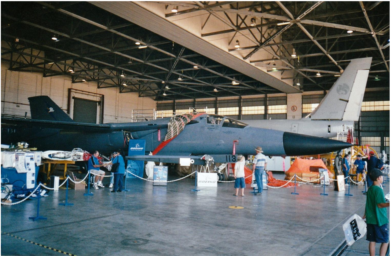
F-111AUP A8-113 at Boeing Amberley in the early 00's.