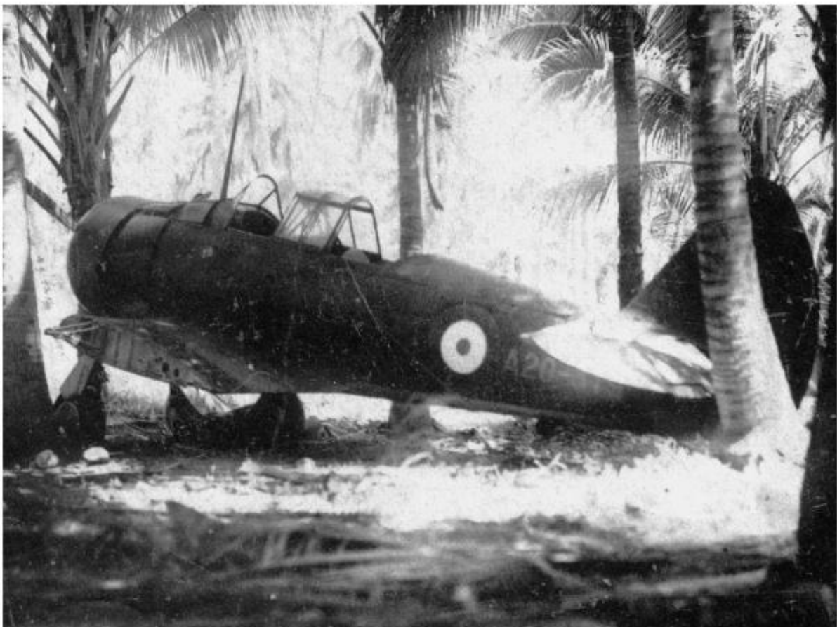
A Picture of 24 Squadron's Wirraway A20-319, under Japanese control at Lakunai.