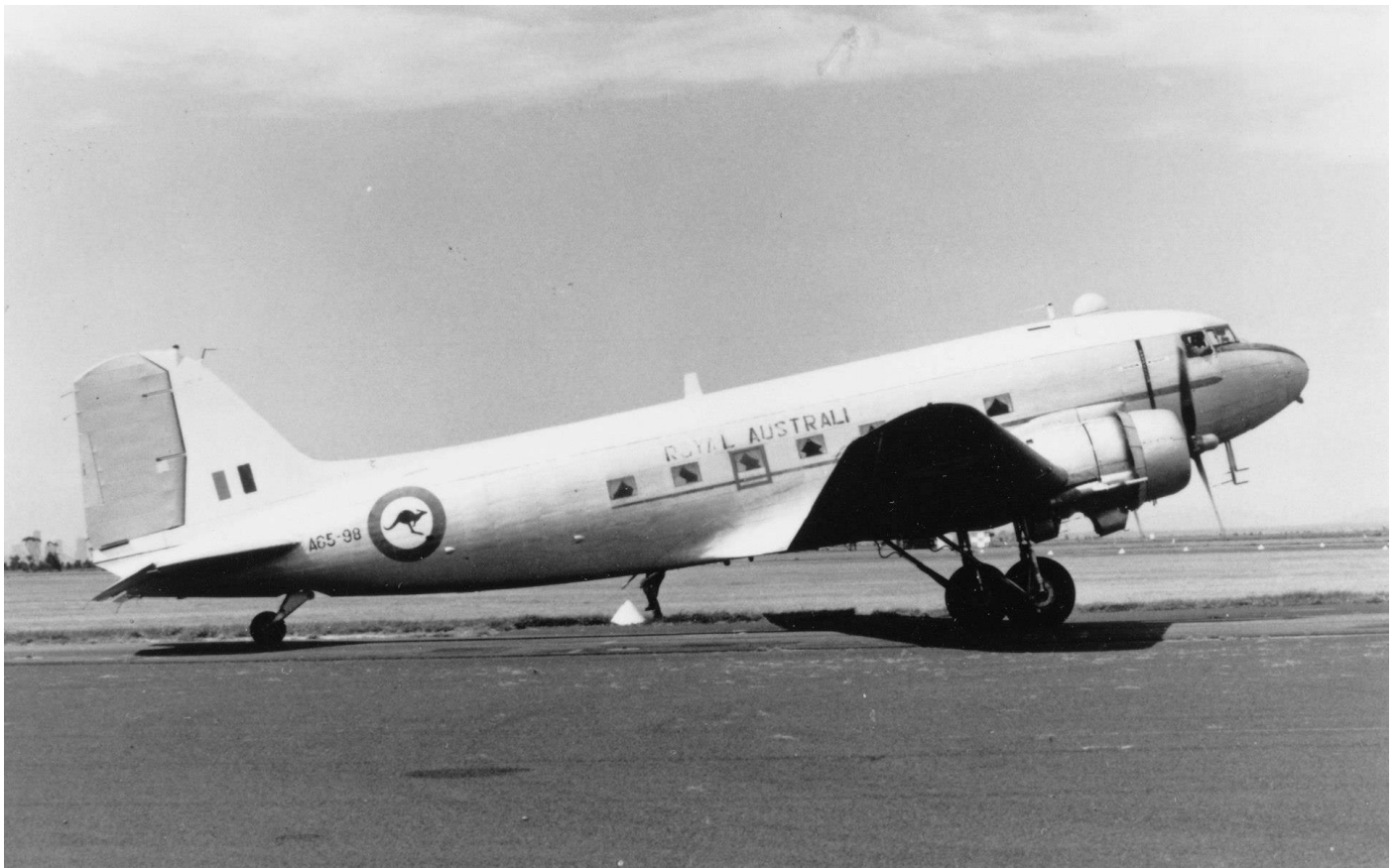
A undated A65-98 picture in VIP fit with curtains, with faded scheme .

Next Issue, the Spring 2015 edition, will be out circa late September 2015.