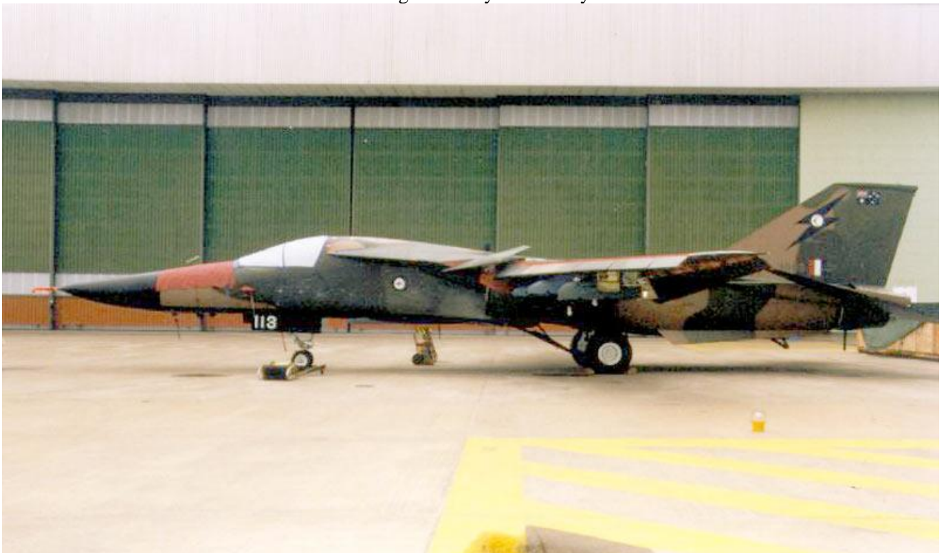
Prior 80's shot before going grey and suffering AUP mods.