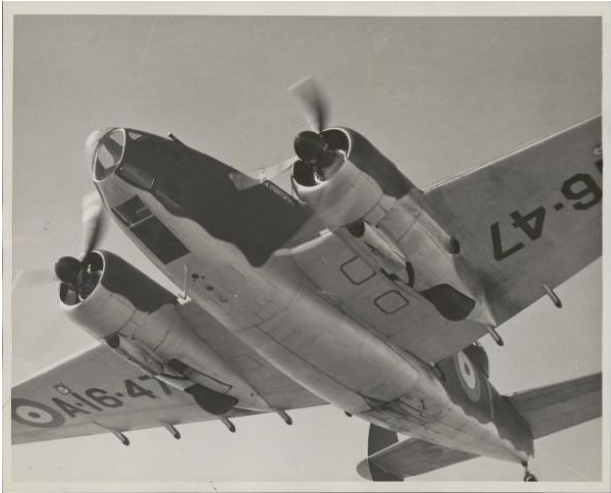
A16-47 is pictured when with 23 Squadron, early in 1941.