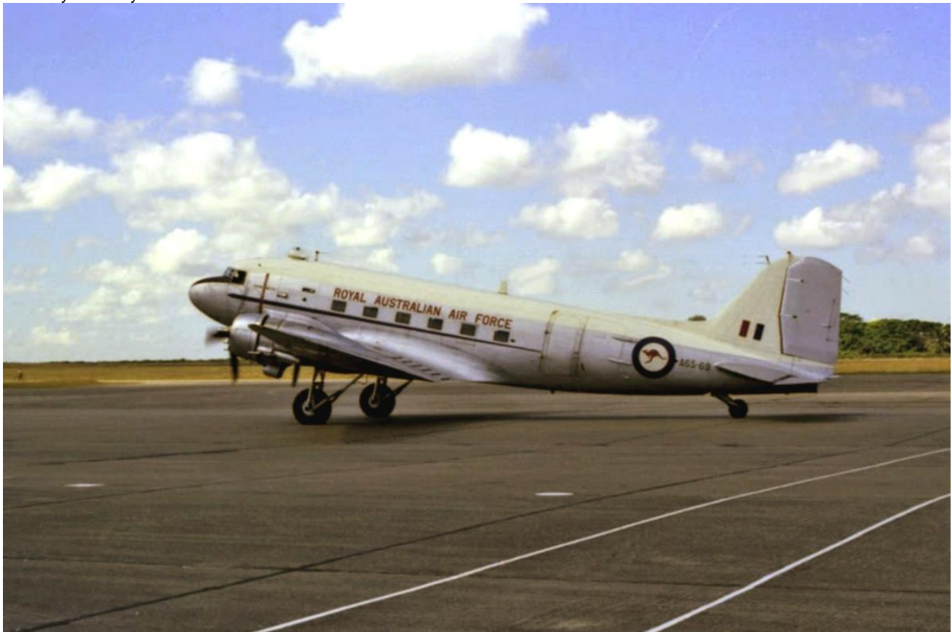
A65-69 when In RAAF Uniform. Photo Credit Unknown

It looks like a RAF Dakota serial number ZD215. It is, but it's actually RAAF Dakota A65-69 on its way to Berlin. Departed for West Germany 06/06/80 under the command of Flt Lt Garry Dunbar RAAF and arrived in West Germany 11 days later. Placed on RAF registry as ZD215 for delivery on 18/06/80 to Berlin Gatow for preservation as due to treaty details that only British, US and French serialed aircraft were allowed safe passage through the Berlin air corridors up to 1989. Flown there by Sqn Ldr Al Culloway RAF and AV Marshall David Evans who was a veteran of the Berlin Airlift. On Display at the Berlin Airlift Museum, RAF Gatow Germany currently. RAF Official