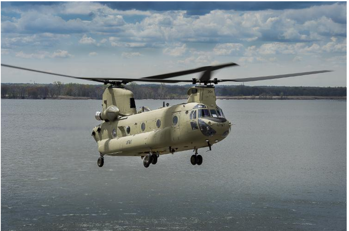
Yet un-delivered (As of this issue)CH-47F A15-304 during a test flight in the USA earlier this year.

5th May 2015: Australia commissioned their first two Boeing CH-47F Chinook advanced configuration aircraft. A15-301 and A15-302 were accepted into C Sqn, 5th Aviation Regiment. Five additional CH-47F helicopters will be delivered by August 2015 to eventually replace the existing fleet of CH-47D Chinooks and Boeing Defence Australia will provide delivery and on-site maintenance support for the aircraft. Earlier retirements have seen CH-47D+ A15-106 to Point Cook and soon, CH-47D+ A15-201 will be delivered to the AWM.