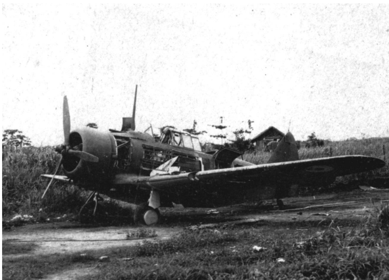
Sgt W Hewitt's 24 Squadron's Wirraway A20-177 abandoned at Vunakanau.

It seems that at least two Wirraway Aircraft were, though damaged up to the invasion; survived relatively intact under their new owners. I can confirm two actual airframes that survived post invasion: