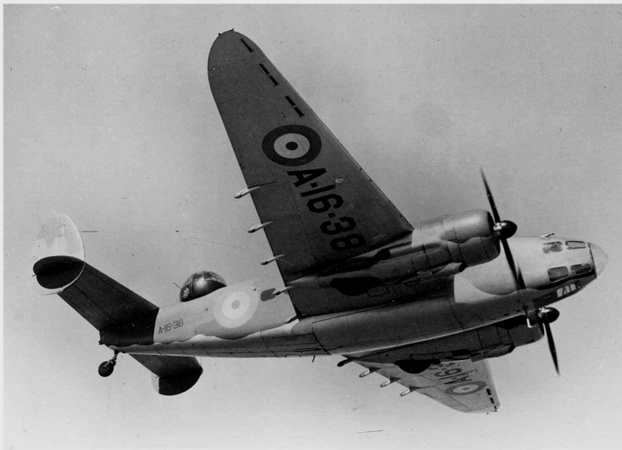
A16-38 aerial shot

The 24 Squadron reinforcement flight of Wirraway aircraft, A20-128 and A20-321, arrived at Moresby at 0116 hrs Zulu on the 17 th January 1942.