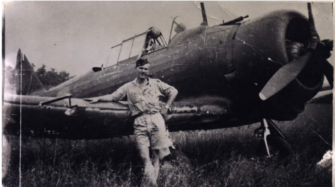
Post Rabaul Wirraway A20-474 pictured in early 1942.

Of the surviving five 24 Squadron RAAF Wirraways, A20-156 and A20-178 were at Port Moresby, along with the damaged A20-154. A20-69 was operational with a crew at Townsville, with A20-66 held unserviceable.