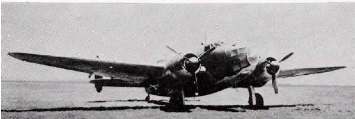
One that was not so lucky to get away: A Captured RAAF (I think due to larger overspray of fuselage and under wing Roundel) or RAF Hudson in Java, as tested by the IJAF in mid 1942. Records indicate that this may well have happened to AE506, abandoned March 42, Java.

Presumably destroyed in combat or subsequently scrapped when in service with the Israel Defence Force, on the 30 th December 1949.