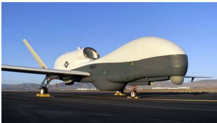
MQ-4C Triton Prototype

"The goal is to provide long-range, long-endurance maritime surveillance and response and an effective anti-submarine and anti-surface warfare capability." Australia's interest in the U.S. Navy's persistent maritime surveillance unmanned systems development dates back to 2007 when it participated in the Broad Area Maritime Surveillance (BAMS) UAS pre-system development and demonstration under a cooperative partner project agreement.