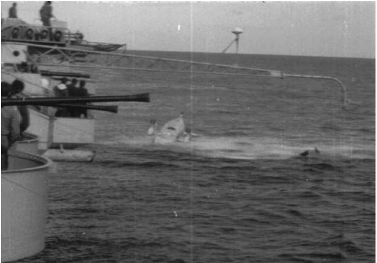
N16-098 on her back

much; disorientation, exacerbated by survival equipment problems, may well lead to panic. Disorientation will always be an issue and training is probably the biggest factor in overcoming it.