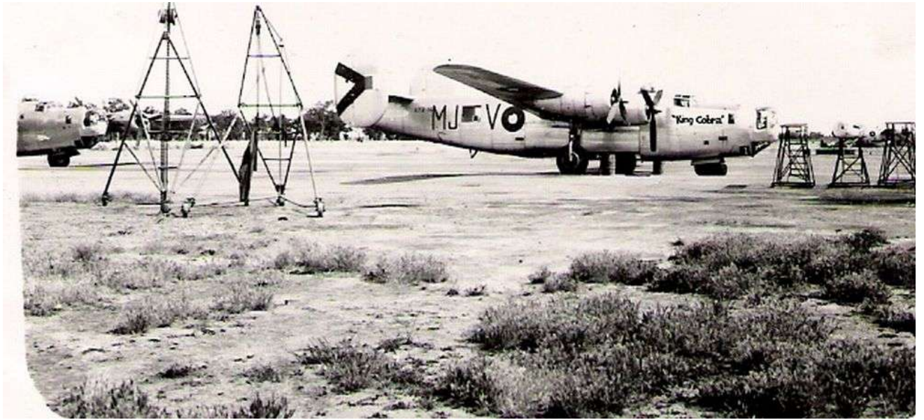
B-24J-155-CO A72-31 MJ-V "King Cobra" of 21Sqn RAAF