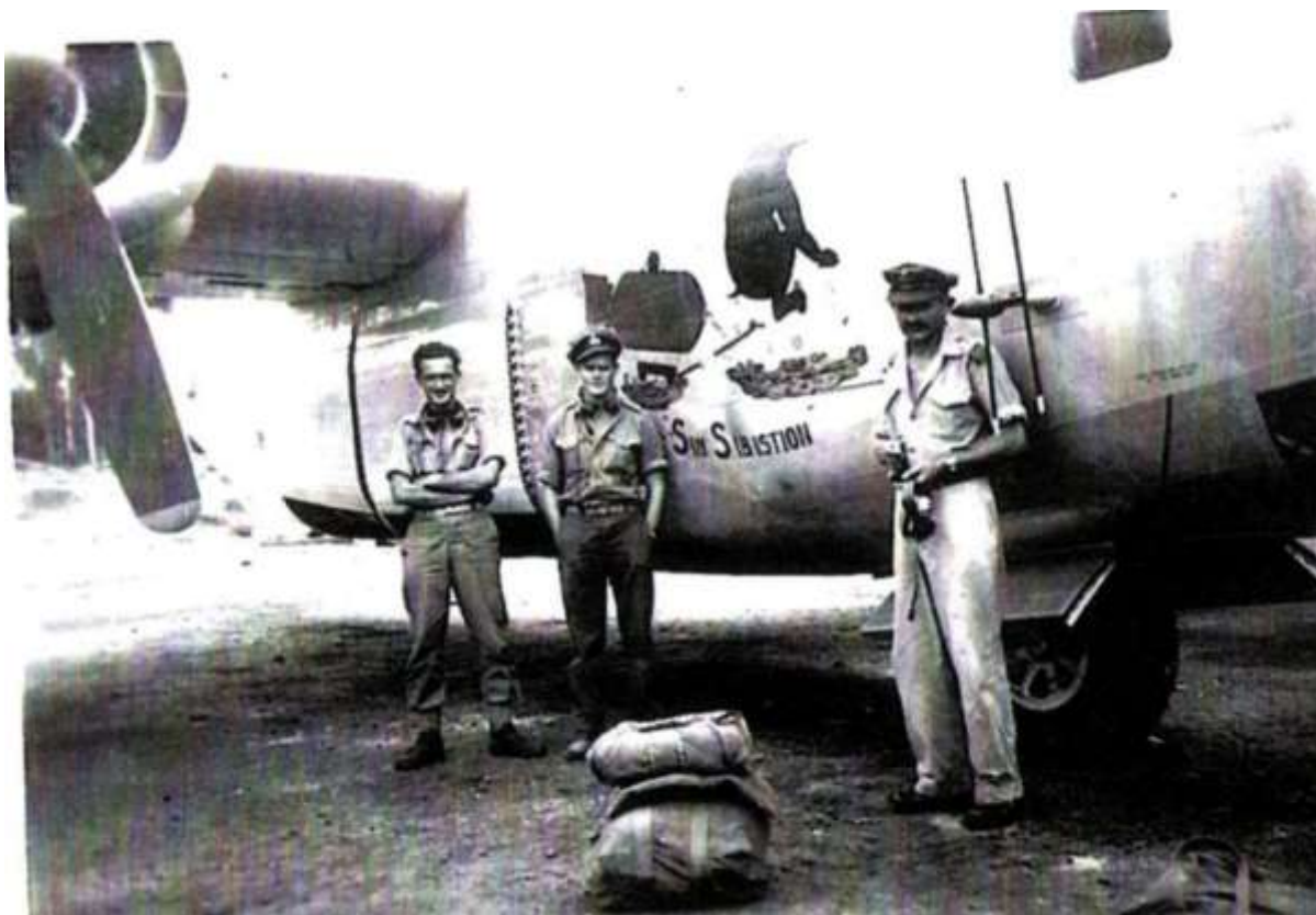
B-24M-10-CO A72-170 GR-Y "Sin Sibiston" of 24Sqn RAAF