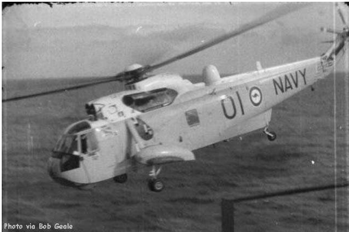
Tail rotor fails and N16-098 is heading for the sea. Bob Geale RAN Rtd(Dec'd)

took me to the gun direction platform to watch real aviation; i.e., what happens on the flight deck of an aircraft carrier. I watched in amazement as the first aircraft, an A-4 Skyhawk came over the 'round-down ' and took a wire. But I was even more amazed when the wire broke! The A-4 [N13- 154909] departed the flight deck and without enough speed to keep flying, disappeared over the angle. LEUT Kev Finan USN (now airline pilot), ejected at the last possible moment and survived unhurt. I remember thinking; well I joined the navy for excitement but, wow! That was back in May 1979, and that same day, I too was to find out what swimming was all about.