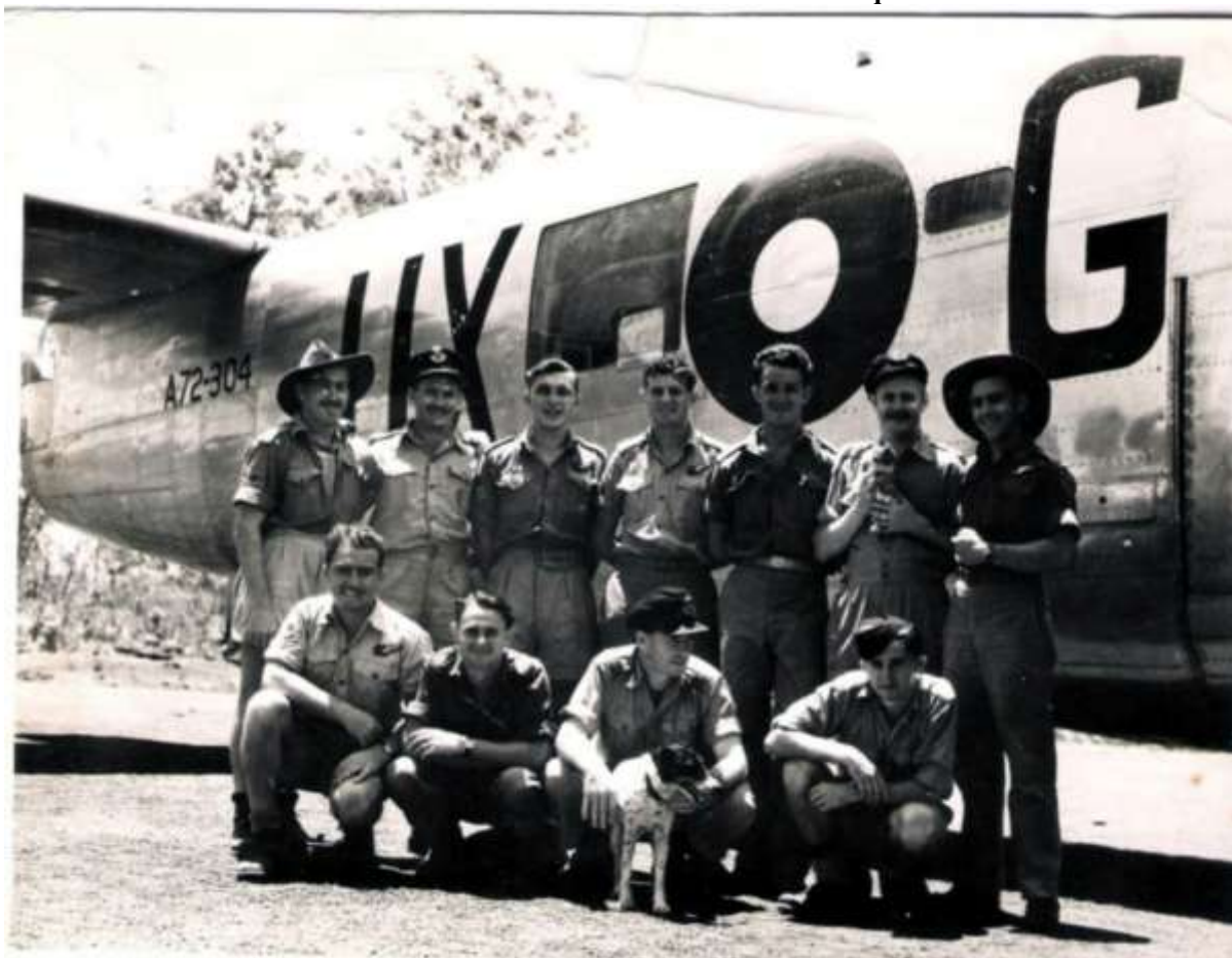
B-24J-5-NT A72-304 UX-G 99Sqn RAAF