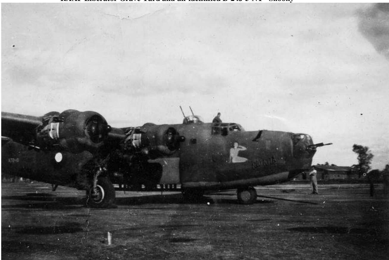
B-24D-20-CO A72-10 "Rio Rita" of 7 OTU

Next Issue, the spring 2013 edition, will be out circa late August 2013.