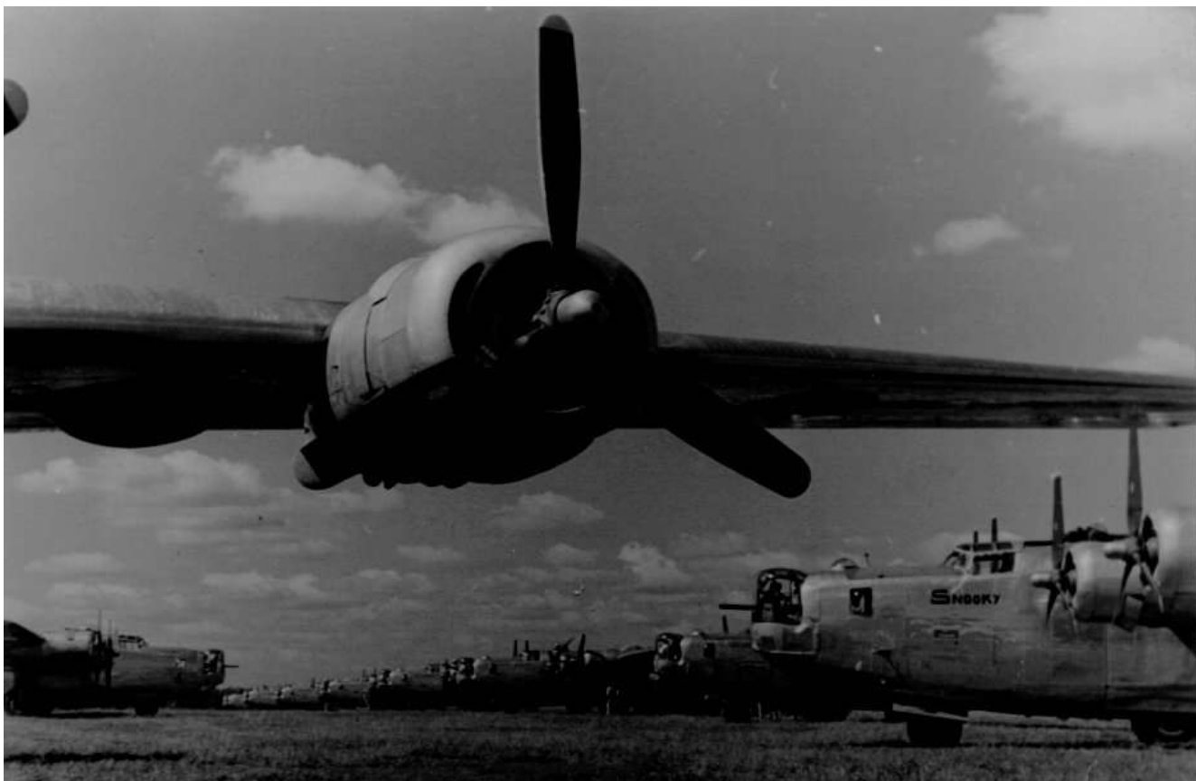
RAAF Liberator Grave Yard and un-identified B-24J-5-NT "Snooky"