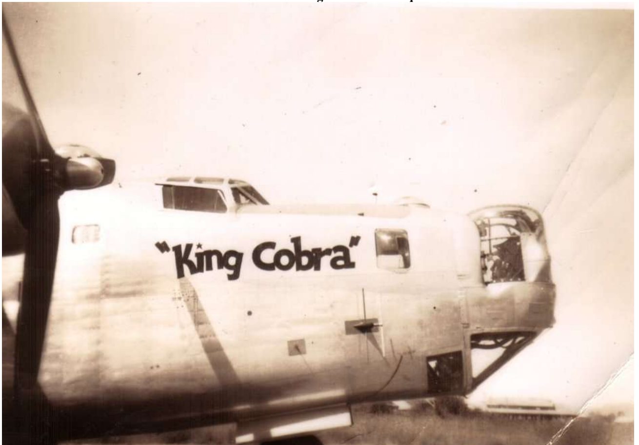
Close up of A72-31's nose